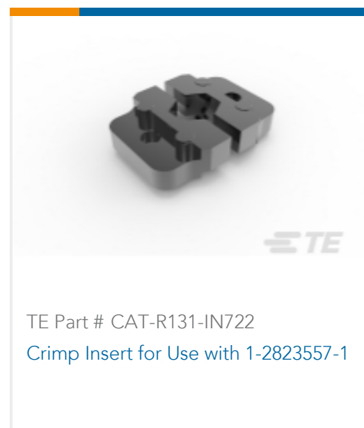
TE Part # CAT-R131-IN722 Crimp Insert for Use with 1-2823557-1