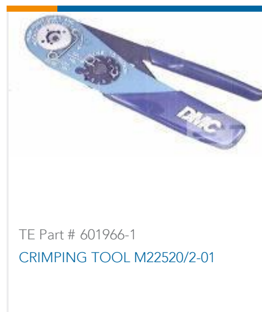
TE Part # 601966-1 CRIMPING TOOL M22520/2-01