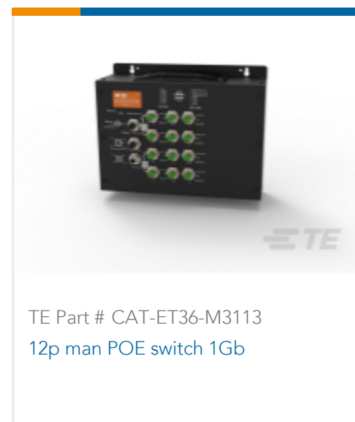
TE Part # CAT-ET36-M3113 12p man POE switch 1Gb