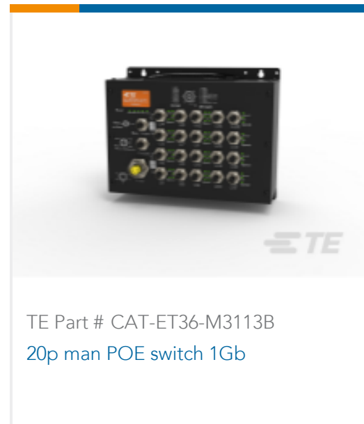
TE Part # CAT-ET36-M3113B 20p man POE switch 1Gb