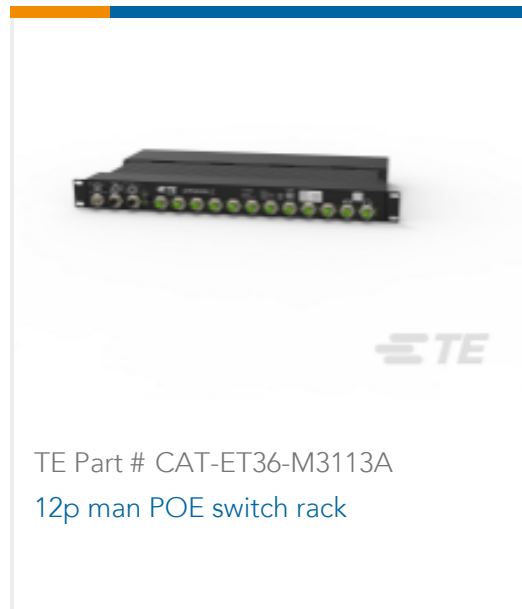
TE Part # CAT-ET36-M3113A 12p man POE switch rack